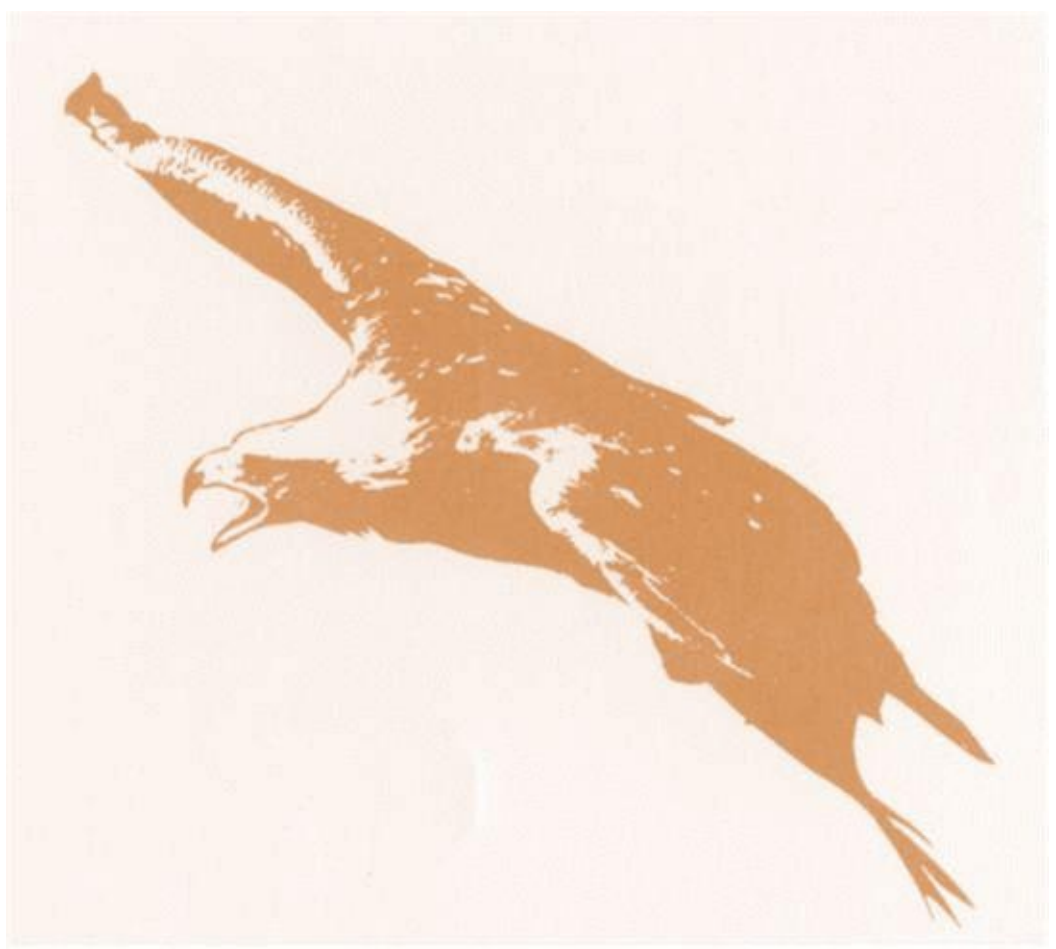
"But they that wait upon the Lord shall renew their strength; they shall mount up with wings as eagles; they shall run, and not be weary; and they shall walk, and not faint." The Prophet Isaiah Chapter 40, Verse 31